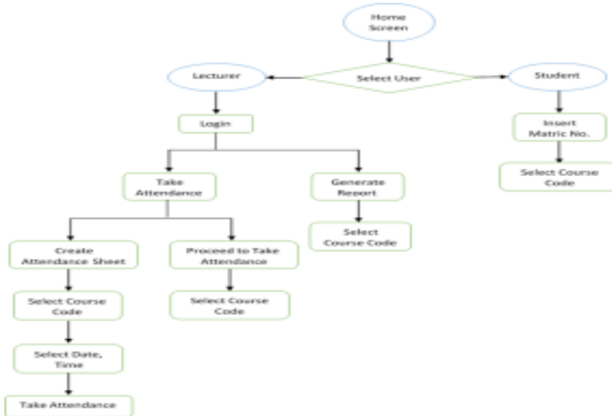
Figure 2. NFC-enabled Attendance System Interface

respectively. The hardware component of reader unit are NFC enabled Android smartphone and student materials card with NFC tag while the server unit is the computer that host web services and databases. This part of the paper consists of, how two sections that are User Interface which explains about the user interface of the project and the System interface which also explains about the System interface about how it works and how is it done. The figures 2 show the examples of the interfaces.